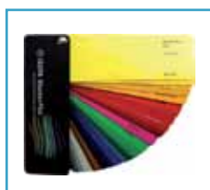
AVAILABLE IN ALMOST ALL RAL COLOURS