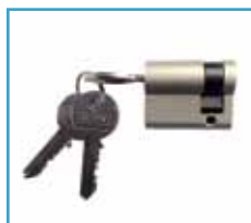
VARIOUS 1/2 EURO-PROFILE CYLINDERS