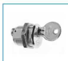
VARIOUS SCREW CYLINDERS