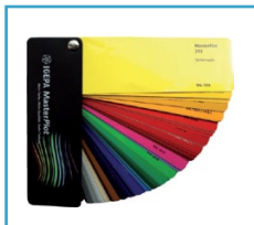
AVAILABLE IN ALMOST ALL RAL COLOURS