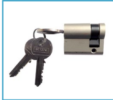
VARIOUS 1/2 EURO-PROFILE CYLINDERS