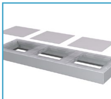
SWIVEL PLATES FOR PLINTH