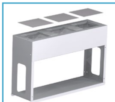
SWIVEL PLATES FOR BASE